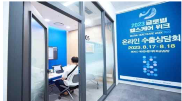
1 On 1 Business Consultation (Remote)