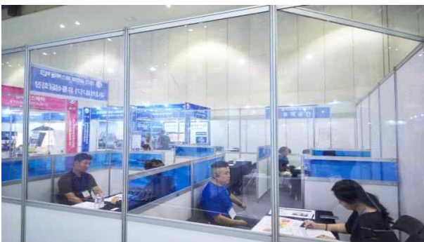
1 on 1 Domestic Consultation